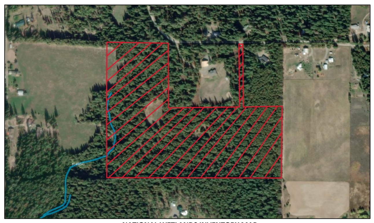
NATIONAL WETLANDS INVENTORY MAP BLUE – MAPPED RIVERINE WETLANDS