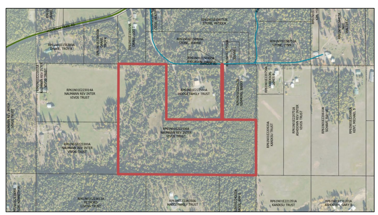
AERIAL OF PROPERTY

Per Section 11.3.5., a Primitive Subdivision: Subdivision by short plat to create subdivisions primarily intended for residential development, or where each lot meets or exceeds the density of the zone district in which it lies, but are not less than five acres, and not more than two lots, and which makes limited or no provision for the construction or installation of basic utilities, to include roads, water, septic or electrical service. Primitive subdivisions will accurately disclose the level of services or lack thereof on the face of the plat, and each lot so created will have, at minimum, defined access and easements meeting width requirements established by the current Boundary County Road Standards Manual from an existing public road.