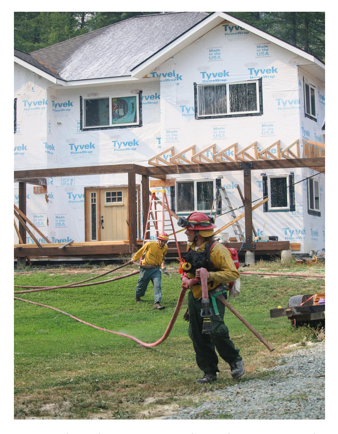
Foaming down a home to save it, Local Fire Fighters were assigned to protect all the homes and structures