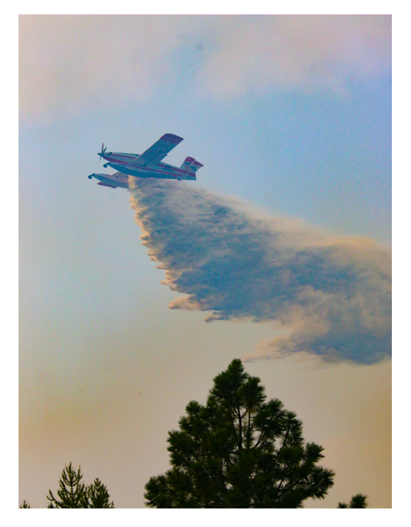
The dump from the skimmer aircraft