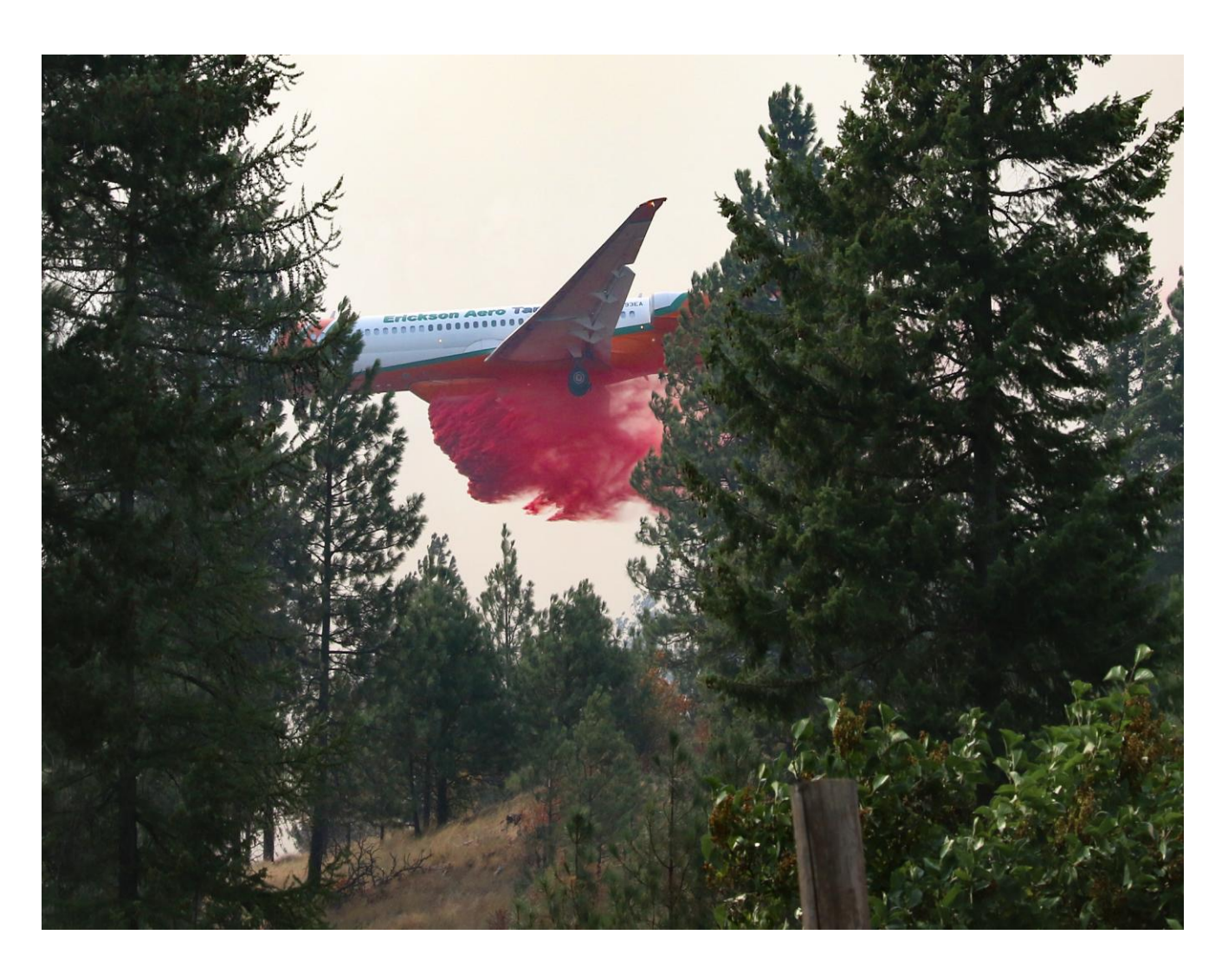
One of the heavy retardant aircraft unloads, we are really close